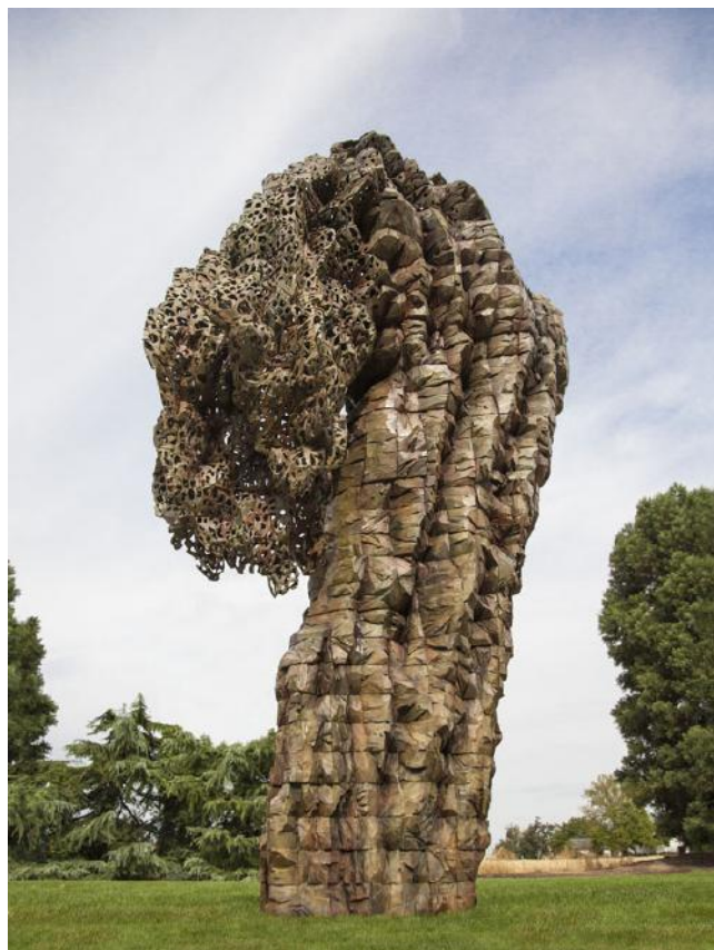
Ursula Von Rydingsvard, "Bent Lace" (2014). Bronze. 9'4" x 5'9" x 3'4".

manipulate color for my paintings and larger installations.