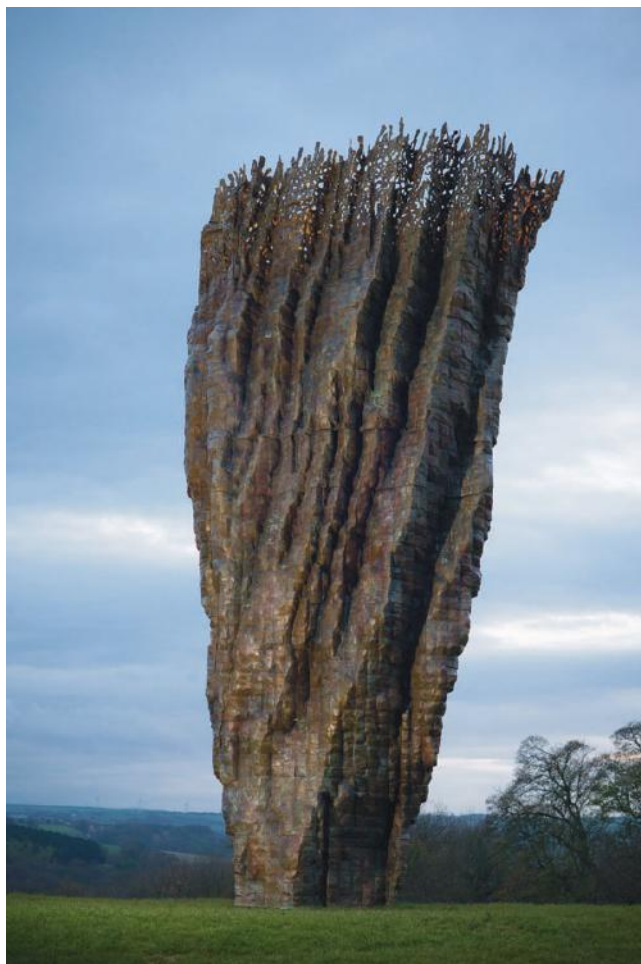
Ursula Von Rydingsvard, “Bronze Bowl with Lace” (2013–14). Bronze. 19'6" × 9'5" × 10". Installed at Yorkshire Sculpture Park, West Yorkshire, England, UK.

Rail: You have spoken about your choice of using cedar in a very similar way to Claudia's