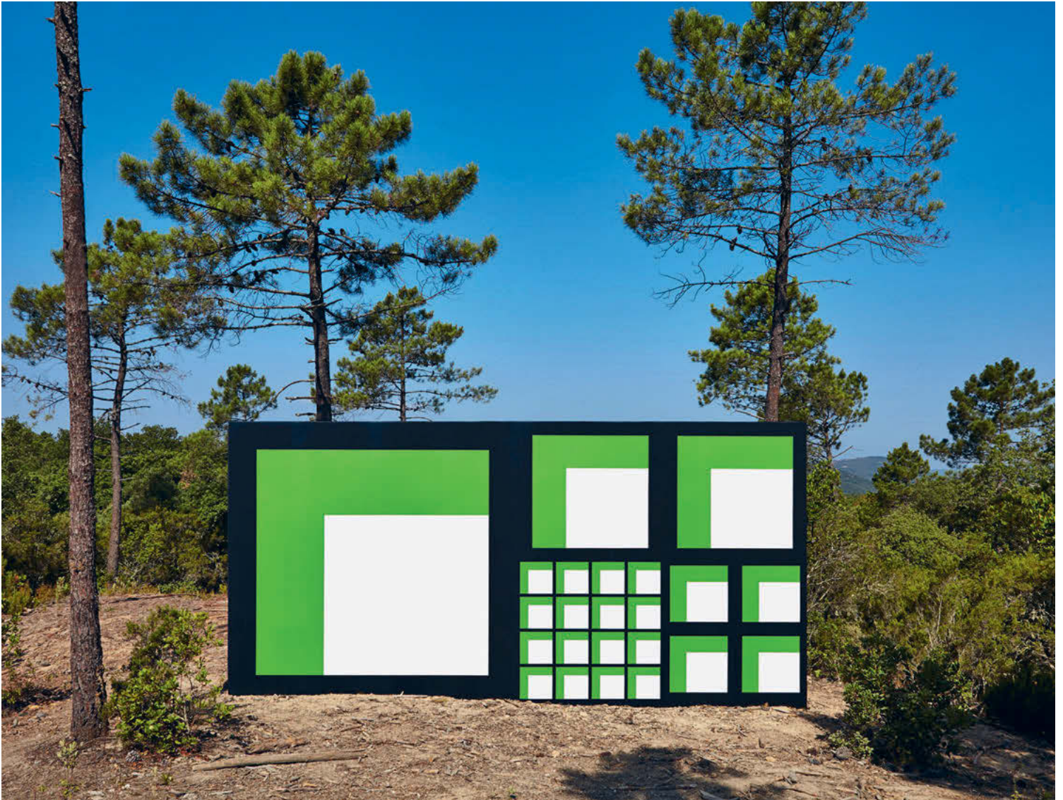
'Outdoor Wall Painting' at Domaine de la Muy, 2015.