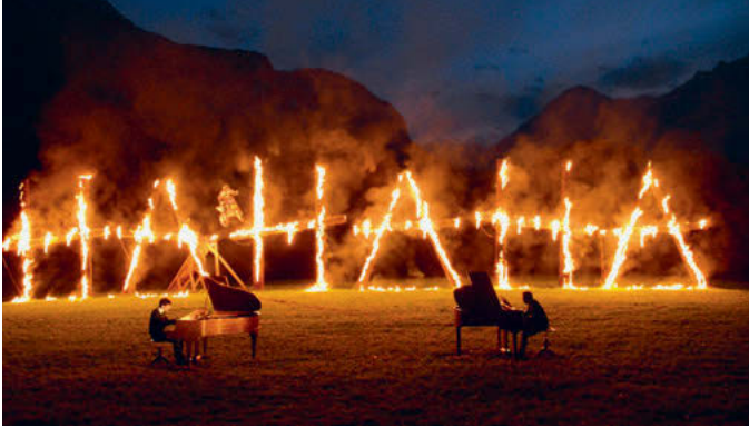
Video still from 'La Dance Macabre', 2015.