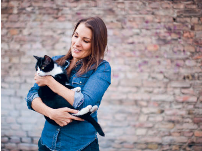
with her cat Minus outside her Berlin studio.