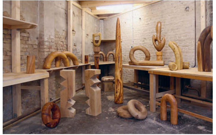
Inside the wood workshop.